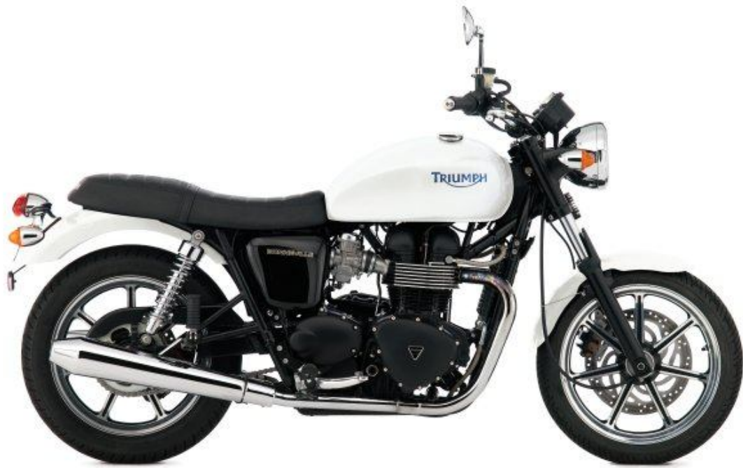
Bonneville (mag wheels) in Fusion White - Model Years 2009 - 2010