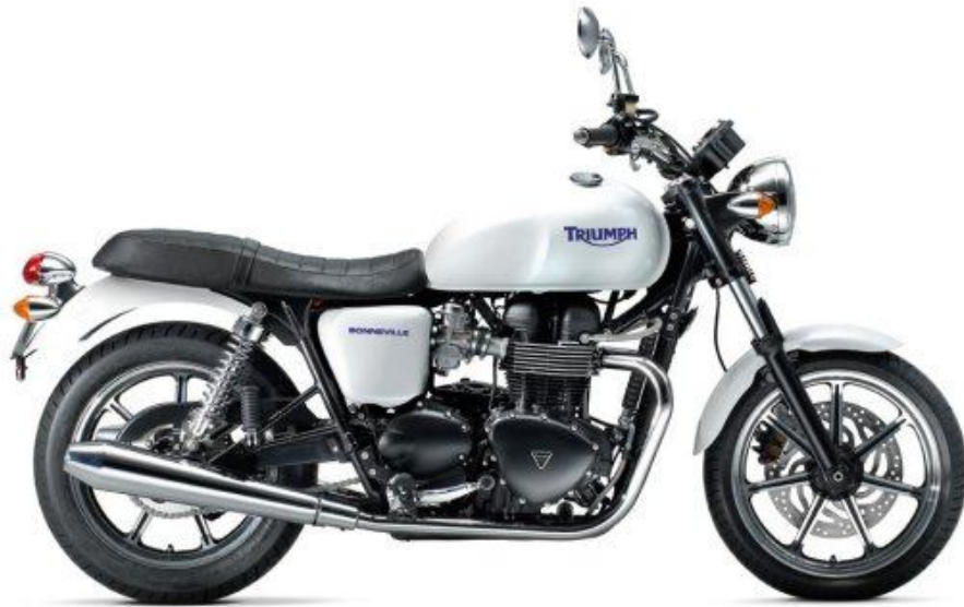
Bonneville in Crystal White - Model Year 2011