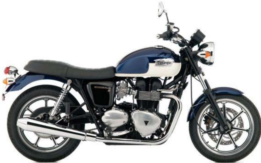
Bonneville SE in Pacific Blue & Fusion White - Model Years 2009 - 2011