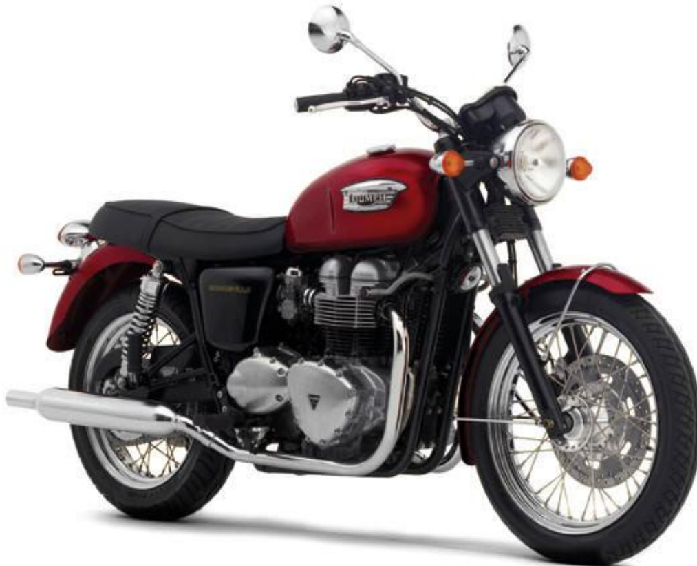
Bonneville in Cardinal Red - Model Years 2003 - 2004