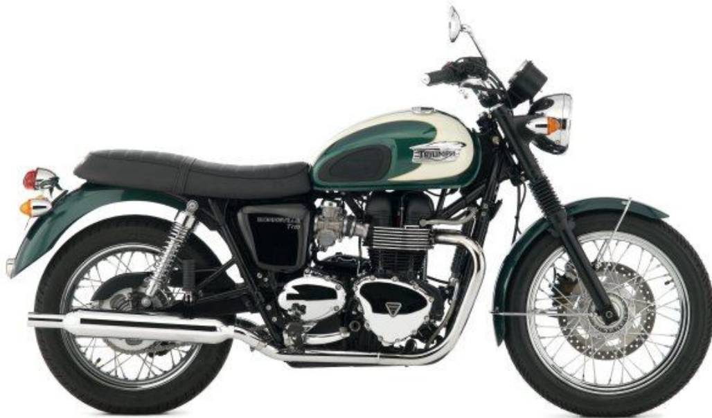
Bonneville T100 in Forrest Green & New England White (black engine) - Model Years 2009 - 2011