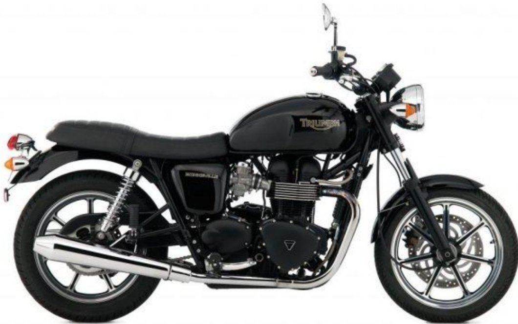
Bonneville (mag wheels) in Jet Black - Model Years 2009 - 2010