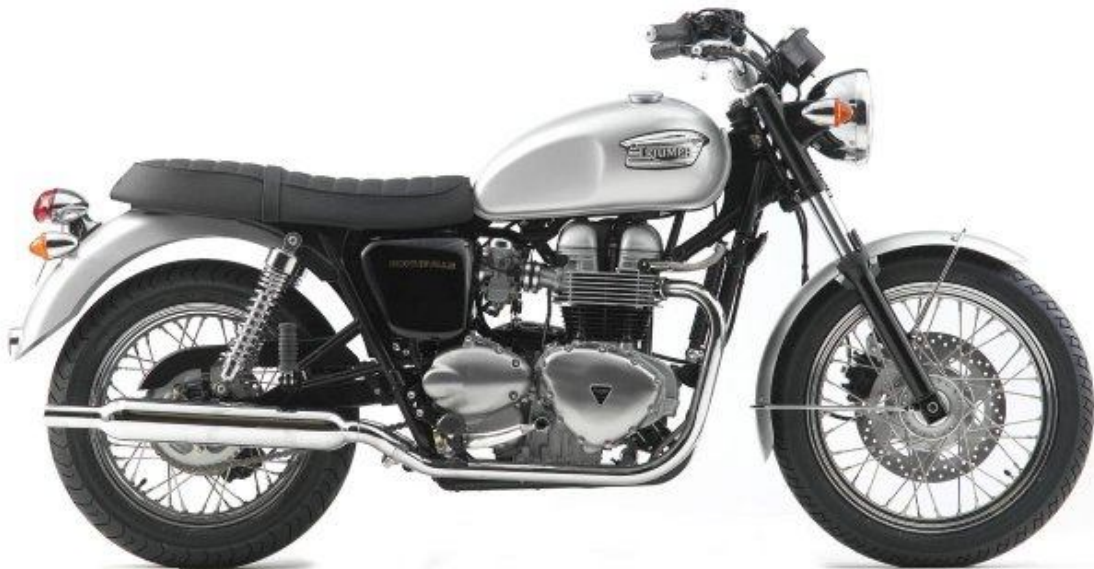
Bonneville in Aluminium (silver engine) - Model Year 2006