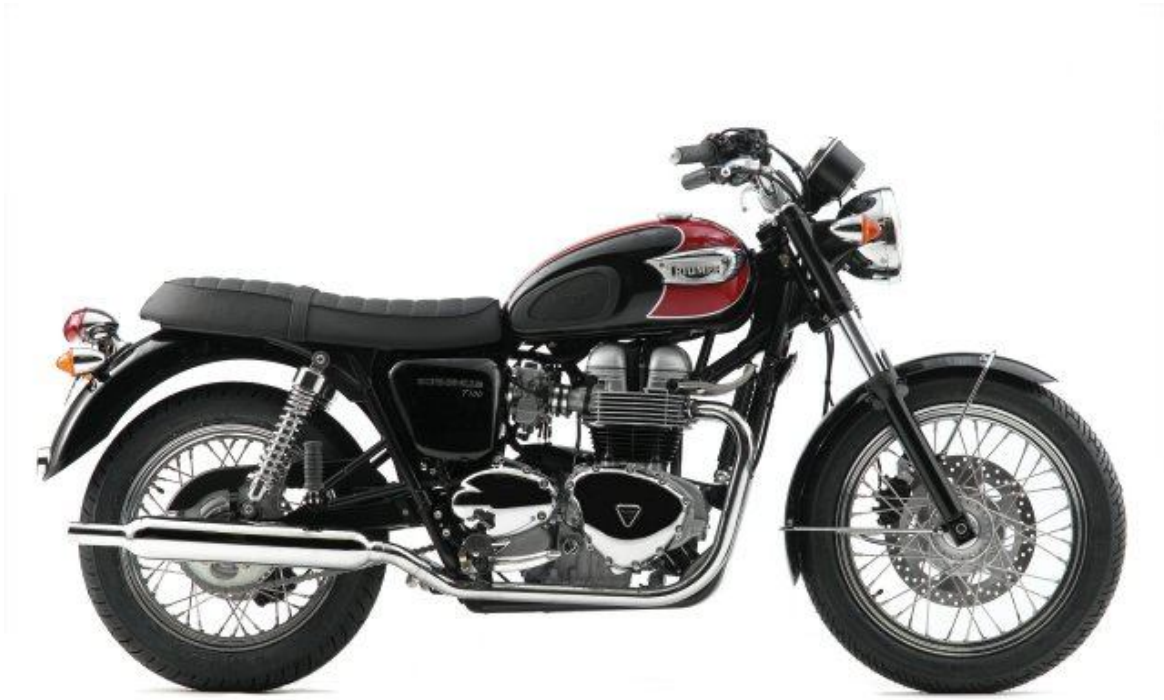
Bonneville T100 in Jet Black & Tornado Red - Model Years 2006 - 2008