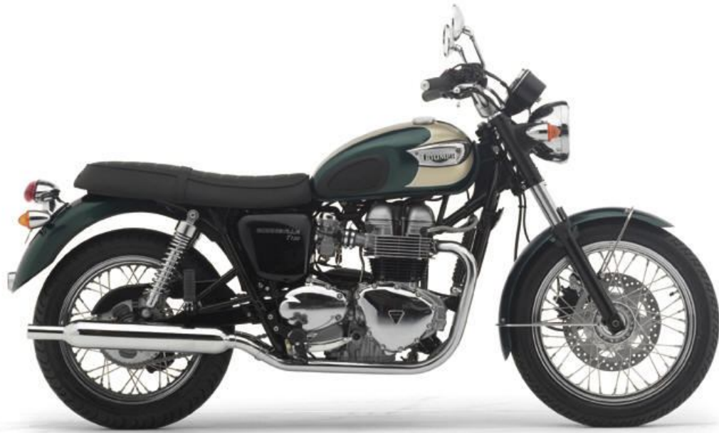
Bonneville T100 in Goodwood Green & Aztec Gold - Model Years 2003 - 2004