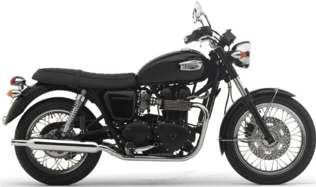
Bonneville in Jet Black (all black engine) - Model Years 2004 - 2009