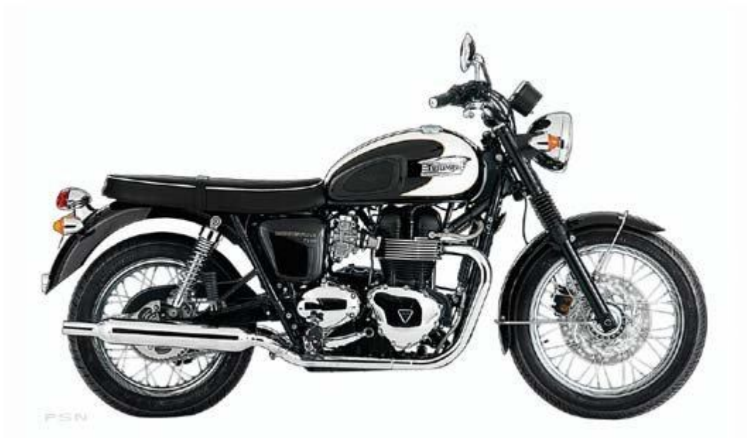
Bonneville T100 in Jet Black & Fusion White (black engine) - Model Years 2009 - 2010