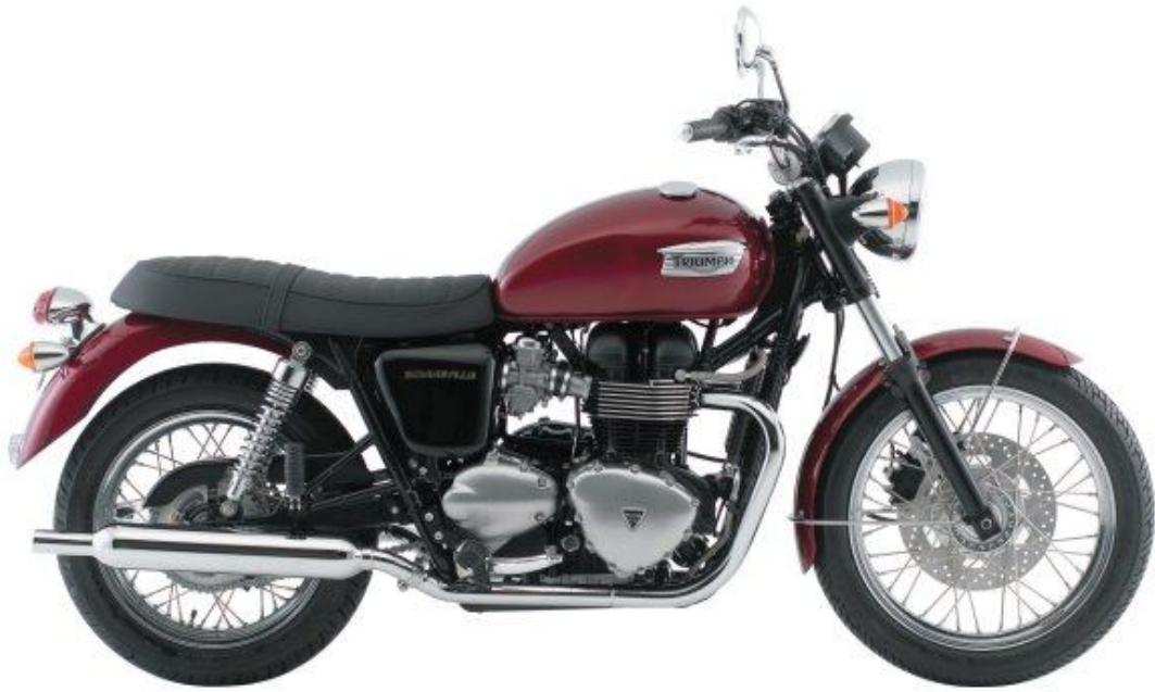
Bonneville in Claret - Model Year 2008