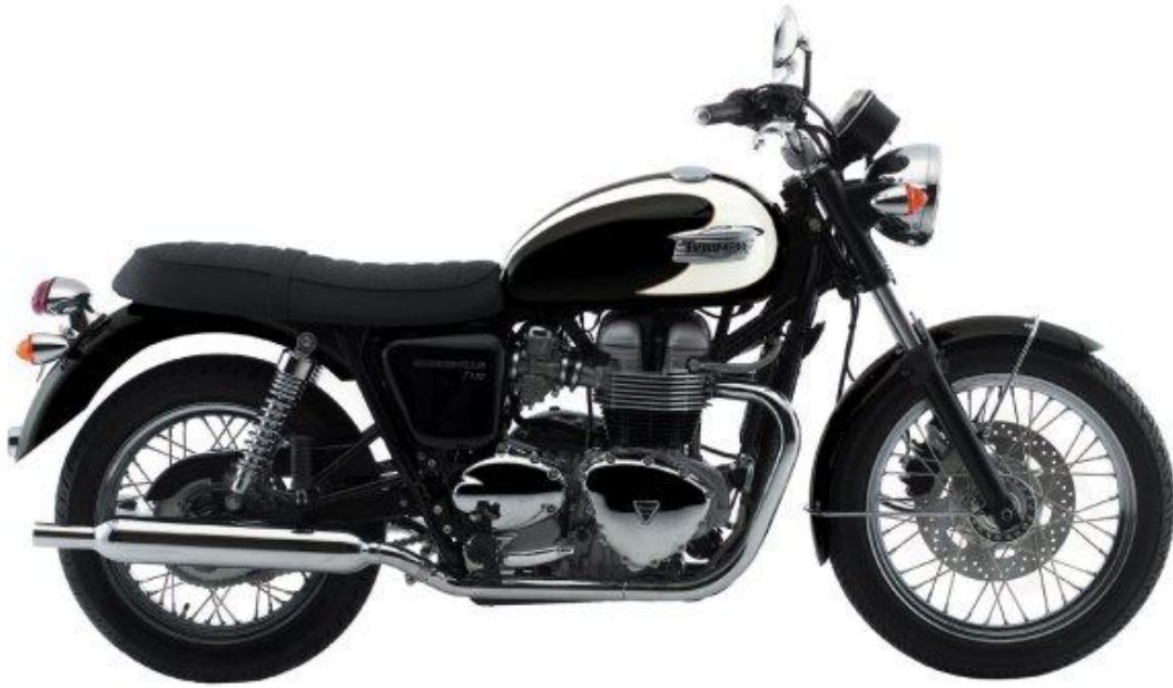
Bonneville T100 in Jet Black & Fusion White (silver engine) - Model Year 2008