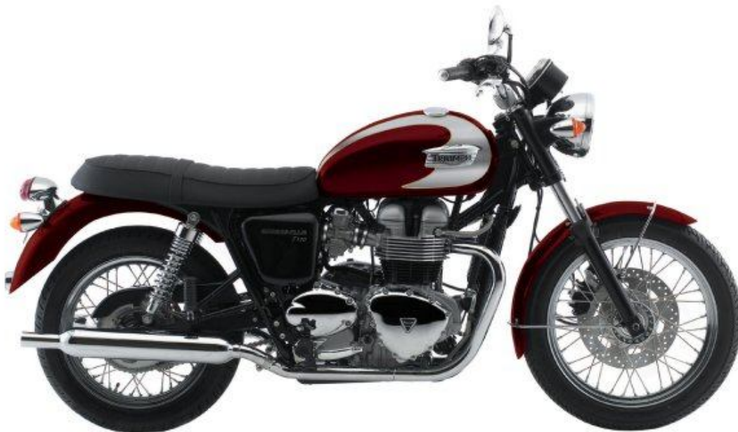
Bonneville T100 in Claret & Aluminium (silver engine) - Model Year 2008