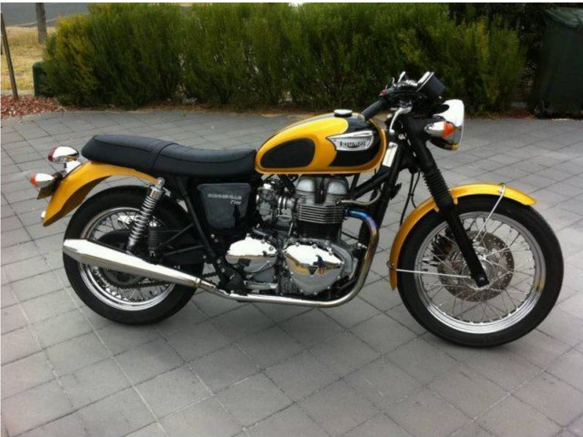
Bonneville T100 Special Edition in Scorched Yellow & Jet Black - Model Year 2006