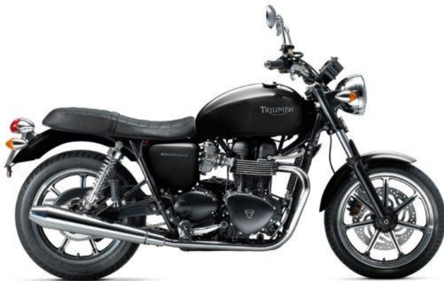
Bonneville in Phantom Black - Model Year 2011