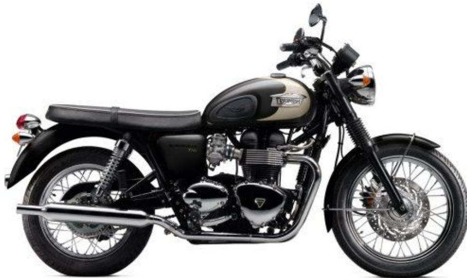
Bonneville T100 in Phantom Black & Fusion White - Model Year 2011