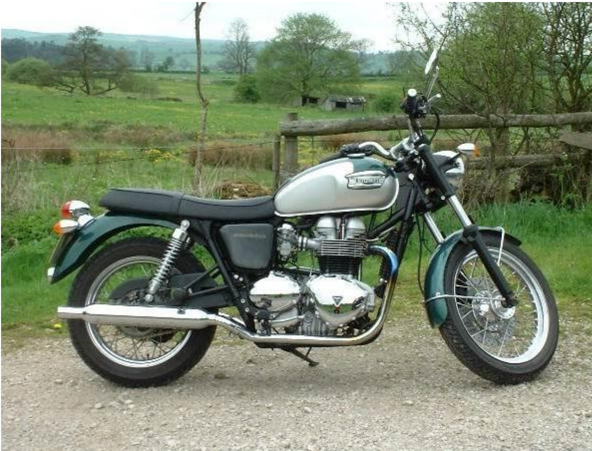
Bonneville in Forest Green & Warm Silver - Model Years 2001 - 2002