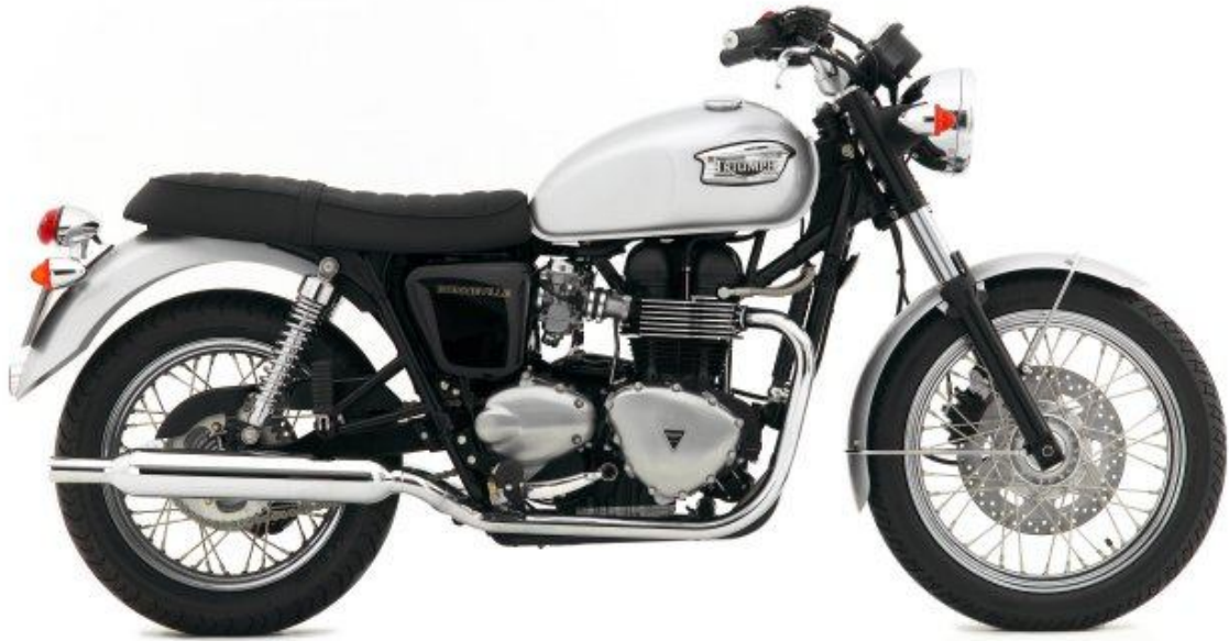
Bonneville in Aluminium (black engine) - Model Year 2007