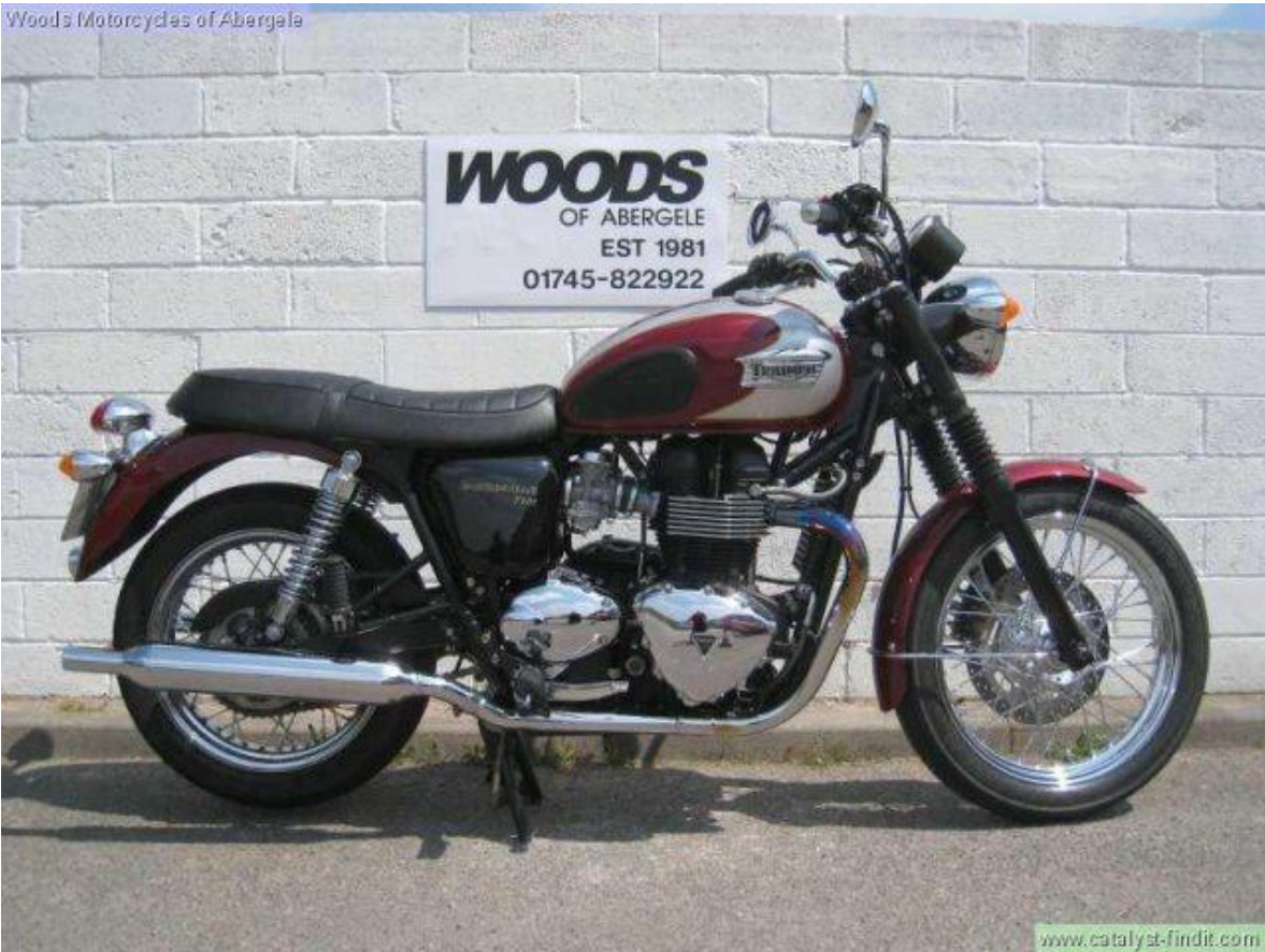
Bonneville T100 in Claret & Aluminium (black engine) - Model Year 2009