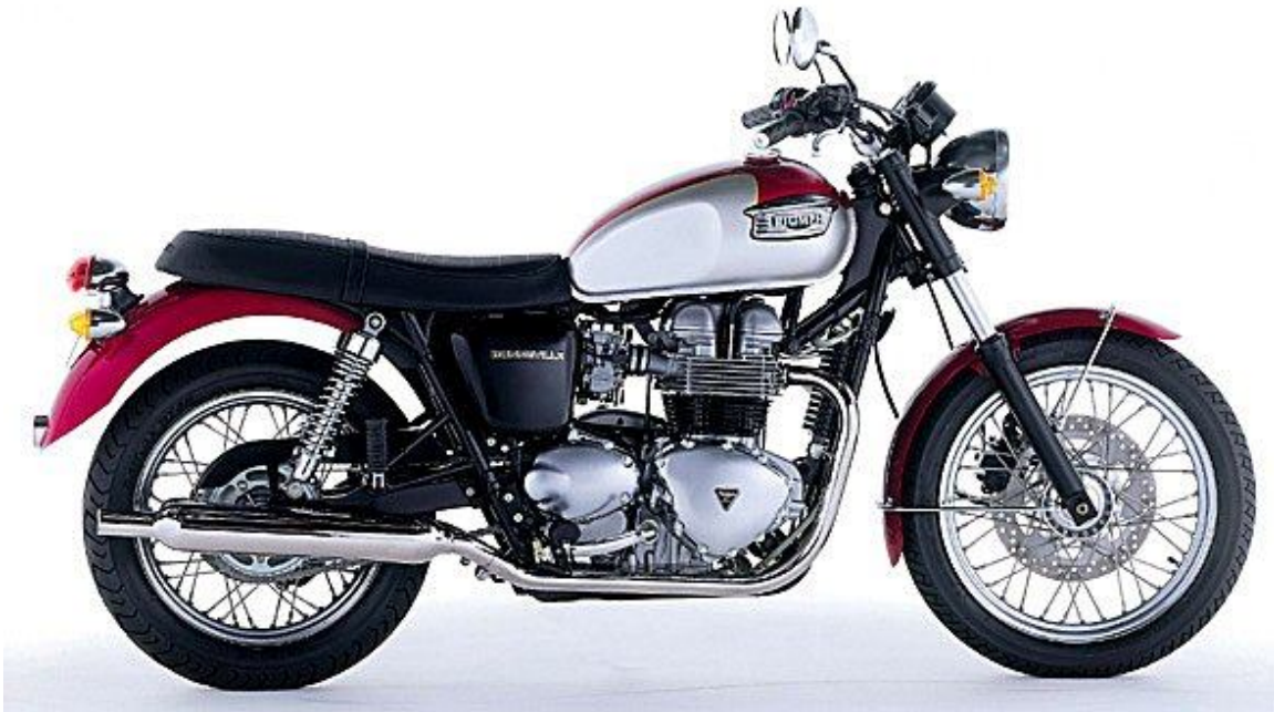
Bonneville in Scarlet Red & Warm Silver - Model Years 2001 - 2002