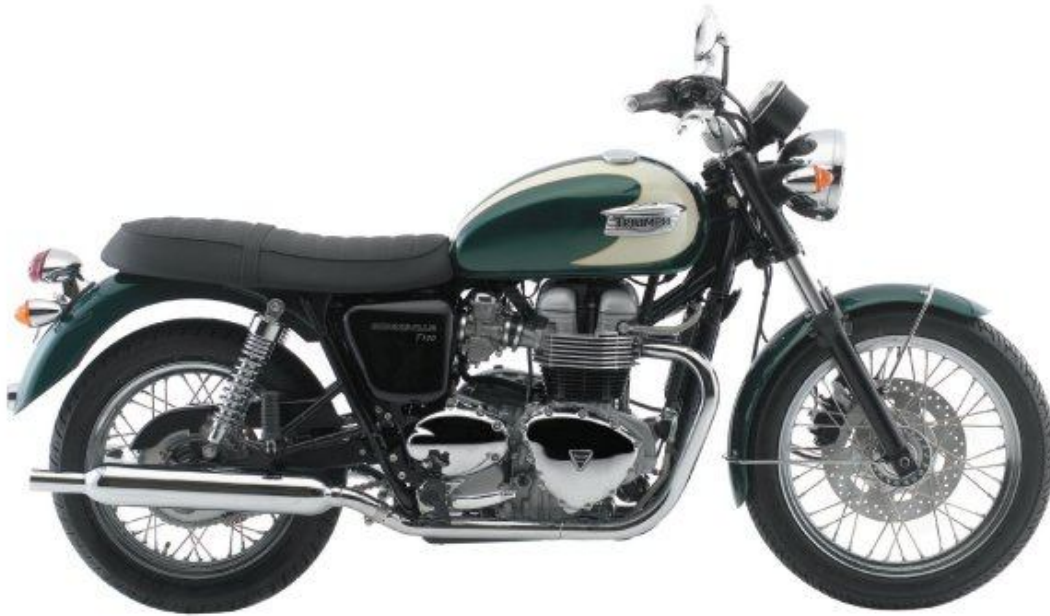
Bonneville T100 in Forrest Green & New England White (silver engine) - Model Year 2008