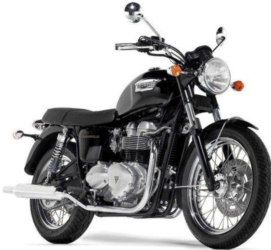
Bonneville in Jet Black (silver engine) - Model Years 2003 - 2006