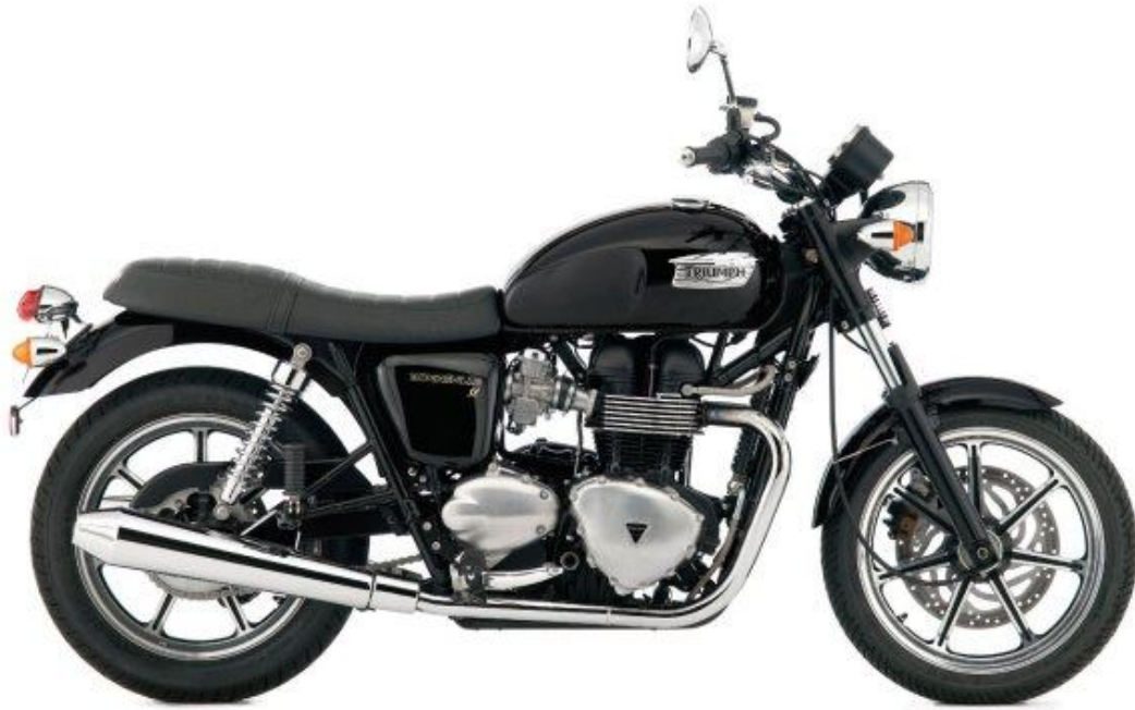
Bonneville SE in Jet Black - Model Years 2009 - 2011