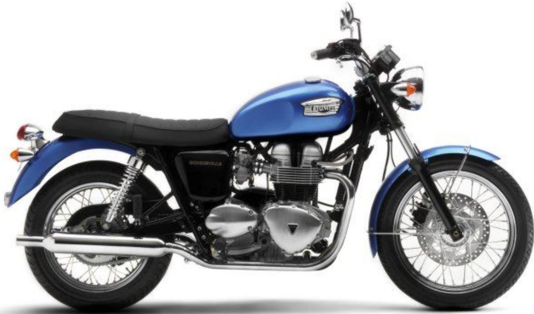
Bonneville in Aegean Blue - Model Year 2005