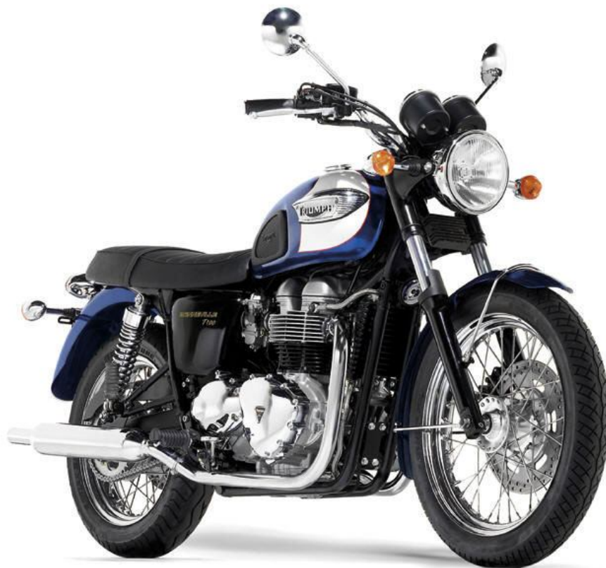
Bonneville T100 in Sapphire Blue & Opal White - Model Years 2003 - 2004