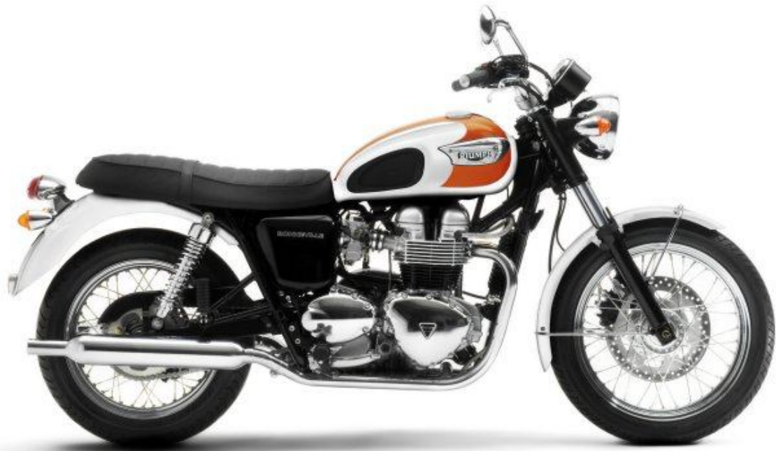
Bonneville T100 in Opal White & Tangerine - Model Years 2005 - 2006