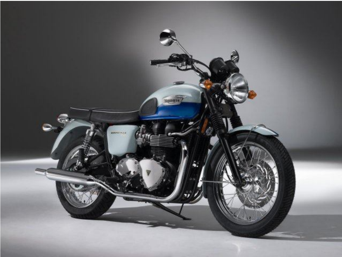
Bonneville T100 1960 Anniversary Edition in Meriden Blue & Caspian Blue - Model Year 2010