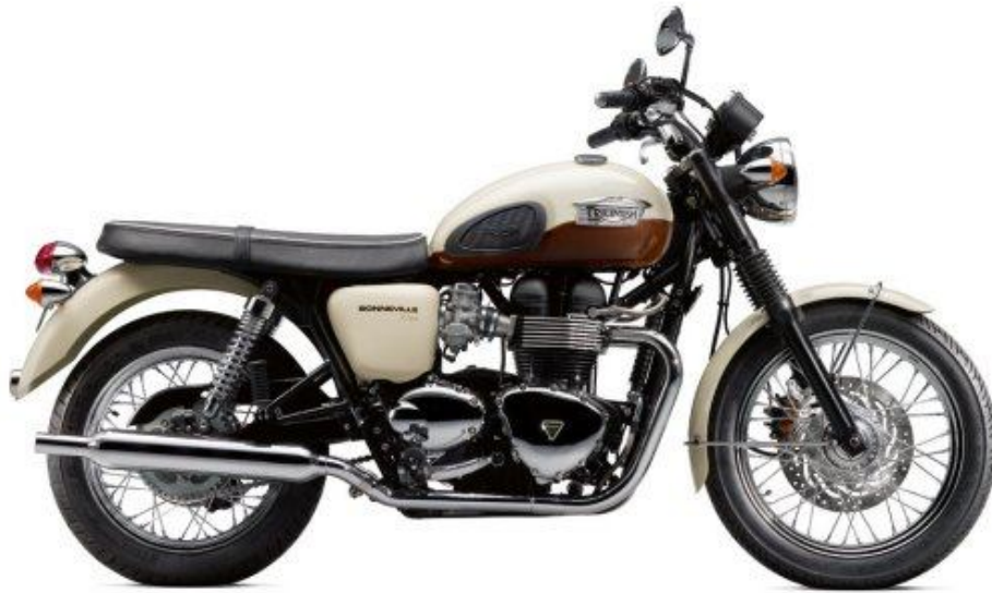
Bonneville T100 in Vintage Cream & Chocolate - Model Year 2011