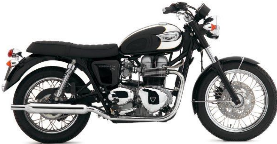
Bonneville T100 in Jet Black & Opal White - Model Years 2004 - 2005 & 2007