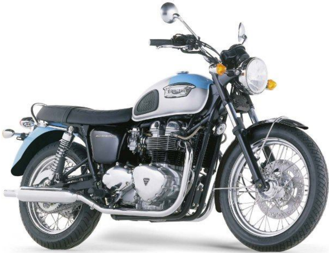
Bonneville in Sky Blue & Warm Silver - Model Year 2002