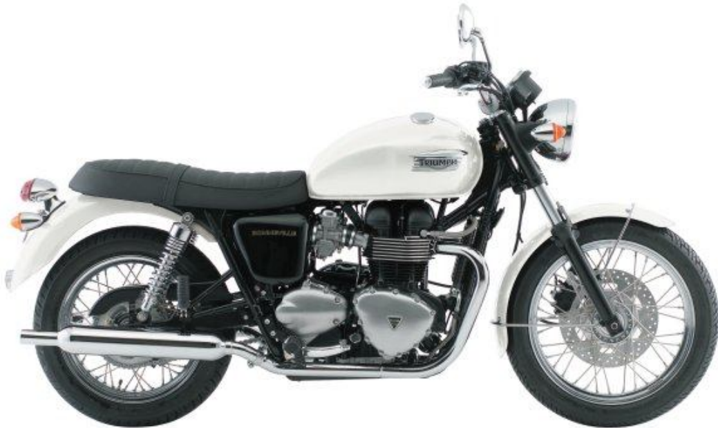
Bonneville in Fusion White - Model Year 2008