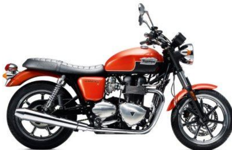
Bonneville SE in Intense Orange & Phantom Black - Model Year 2011