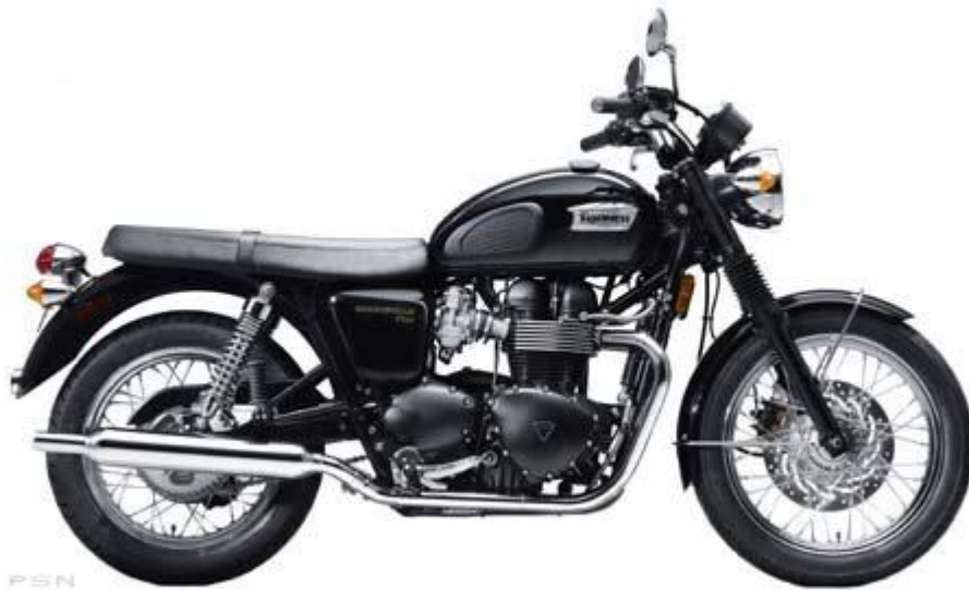
Bonneville T100 in Jet Black (black engine) - Model Years 2010 - 2011