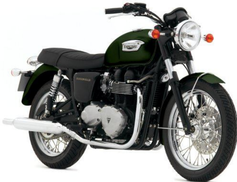
Bonneville in Goodwood Green (black engine) - Model Year 2007