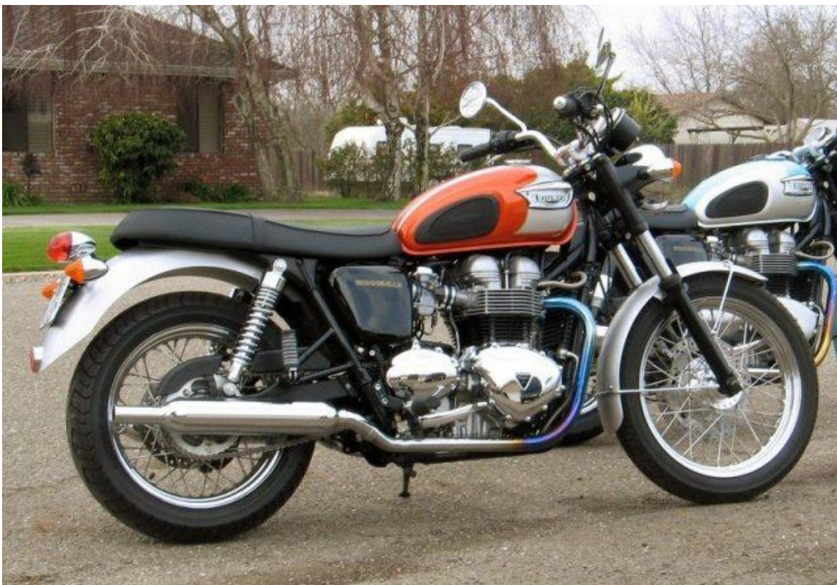
Bonneville T100 Centennial Edition in Lucifer Orange & Warm Silver - Model Years 2002 - 2003