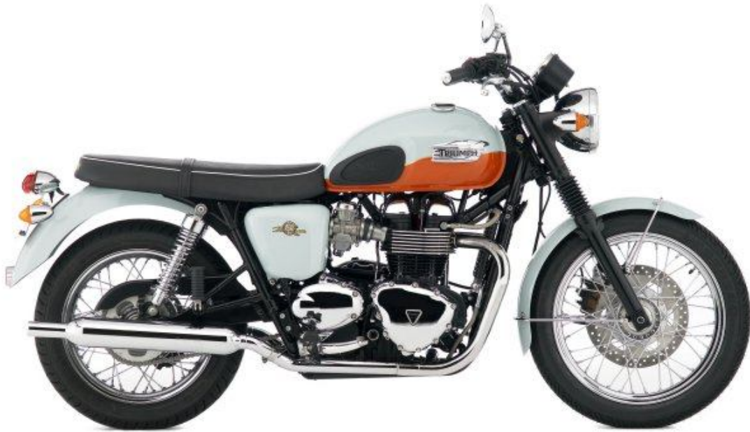
Bonneville T100 50th Anniversary Edition in Meriden Blue & Exotic Orange - Model Year 2009