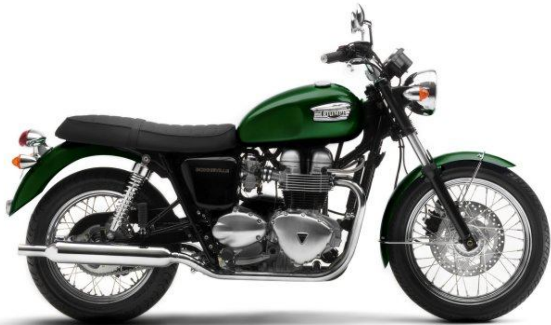
Bonneville in Goodwood Green (silver engine) - Model Years 2005 - 2006