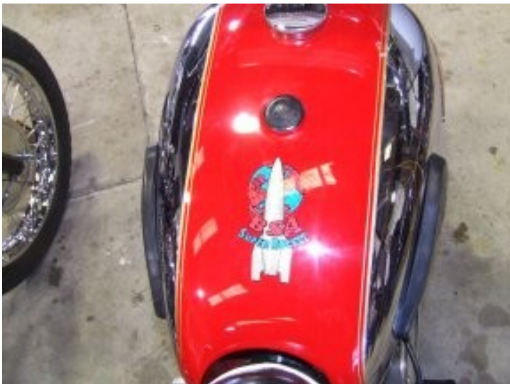
Tank detail at the Bike Show

Wanted:- Norton ES2 camshafts urgently required. Call Bernie 0418 776640