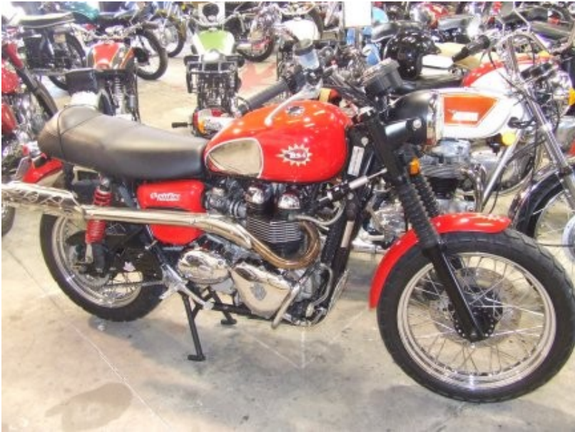
A 2009 BSA Spitfire?????