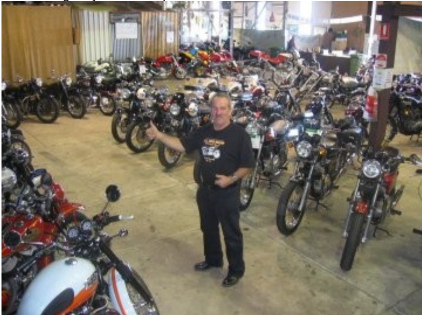
Lucky liked the show