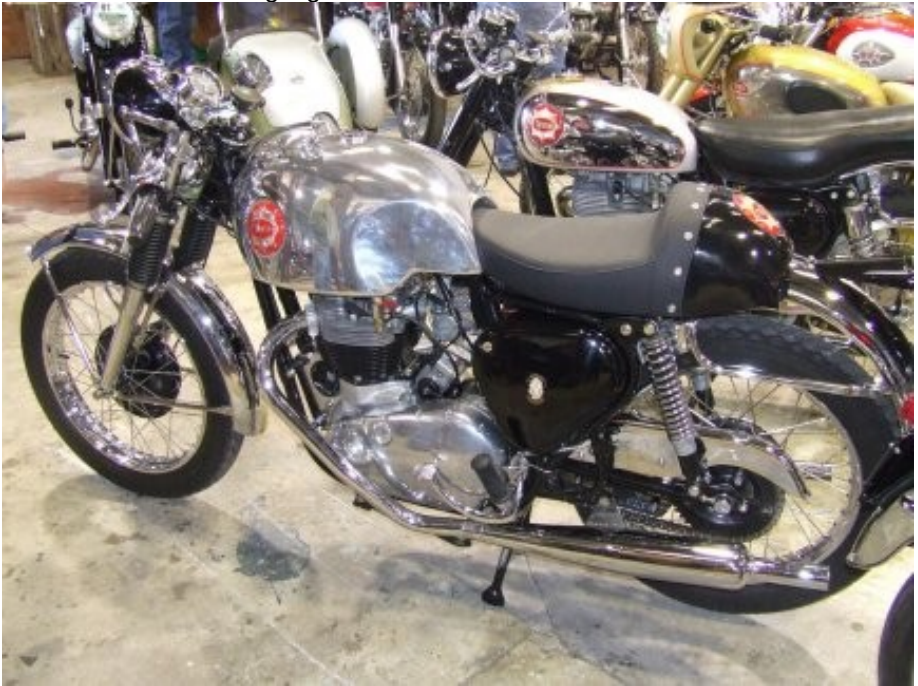
Best in Show and Peoples Choice