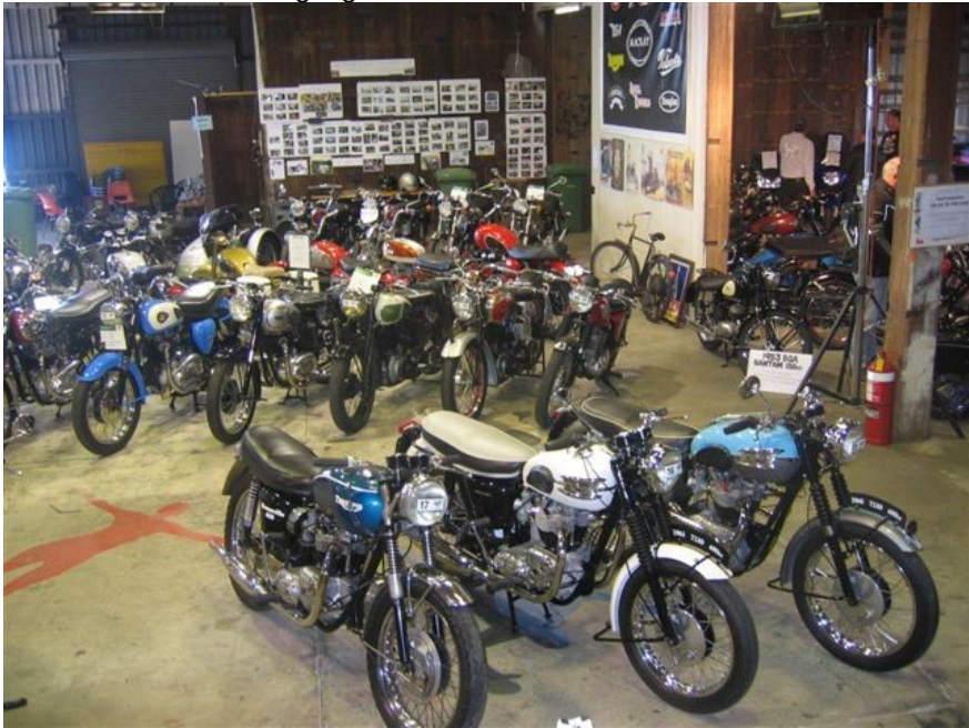
Celebrating 50 yrs of Triumph Bonneville