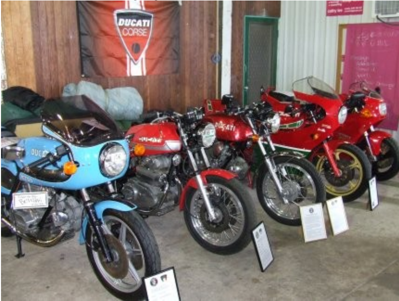
A nice lineup of Ducatis